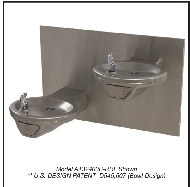
Model A132400B-RBL Shown ** U.S. DESIGN PATENT D545,607 (Bowl Design)

Model A132400S is a wall mounted, bi-level drinking fountain made from 18 gage, 304 stainless steel with a brushed finish. Unit shall be activated by self-closing, frontal push pads, by using less than 5 pounds of force, which activates internally mounted valves with adjustable stream regulators controlling the water flow. Bubblers shall be polished stainless steel with non-squirt features and operate on a water pressure range of 20-105 psig. Unit shall have a uniquely designed, two-piece contoured bowls with P-traps integral to the unit. Unit is certified to ANSI A117.1, Public Law 111-380 (NO-LEAD), CHSC 116875 and NSF/ANSI 61, Section 9. Fixture meets ADA, ADA Standing Person, and ADA Child requirements when mounted appropriately.