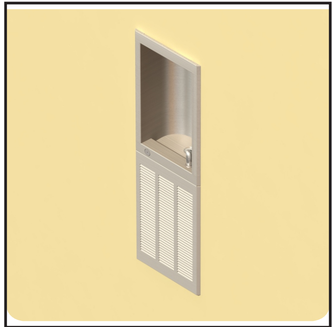
“INDOOR USE ONLY”