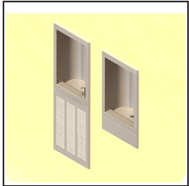
“INDOOR USE ONLY”