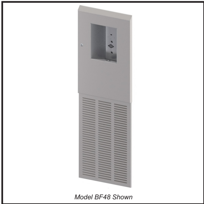
Model BF48 Shown

Model A000000-BF4 is a Semi-Recessed sensor operated bottle filler. Bottle Filler can be mounted in a 4" or larger wall space for simple installation virtually anywhere. Housing has a slim and trim look that blends into your environment. Unit also has a strong, ligature resistant, and vandal-resistant design for years of trouble-free service. When installed properly, the bottle filler complies with ADA forward and side reach requirements. Bottle filler is fabricated of type 304 stainless steel polished to a satin finish. Bottle filler is fabricated of type 304 stainless steel polished to a satin finish. Unit is certified to ANSI A117.1, Public Law 111-380 (NO-LEAD), CHSC 116875 and NSF/ANSI 61, Section 9.