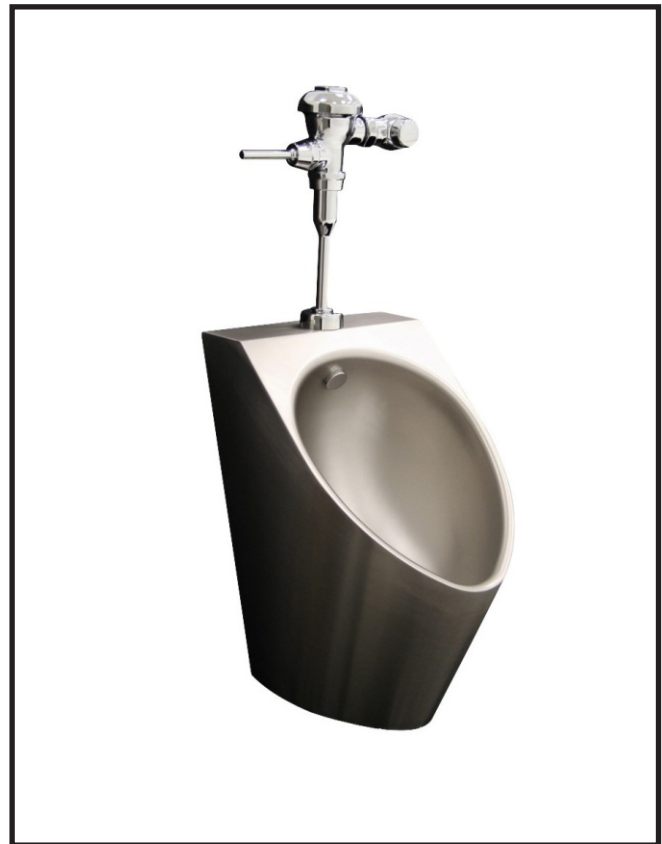
Model Shown: 1036F HEU, TOP SUPPLY WITH OPTIONAL FLUSH VALVE

Urinal is a high efficiency type requiring a 1/8 GPF (0.47 Liters per Flush) to 1/2 GPF (1.8 Liters per Flush) flush valve and supplied with 3/4" NPT flushing inlet connection and 1-1/2" O.D. plain end P-Trap.