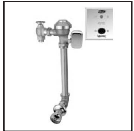
Note: Fixture may show some available options