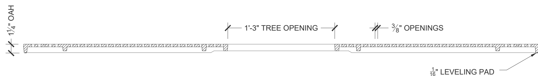
Longitudinal Section Scale: 1 1/2" = 1' 0"