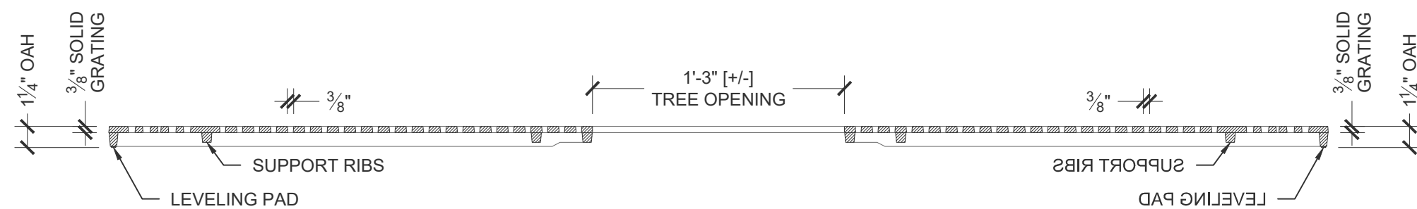
Cross Section Scale: 1 1/2" = 1' 0"